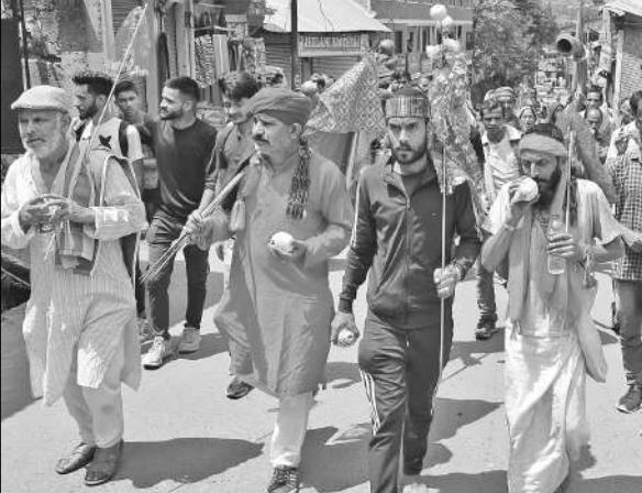
Devotees leaving Bhadarwah on Friday.

devotees with Holy Mace will go via Bhadarwah-Padri-Chamba route on vehicles and will join the first Charri at Bharmod in HP tomorrow, thereafter they will reach Holy lake of Mani-Mahesh on 14th together to have Holly dip and offer traditional prayers.