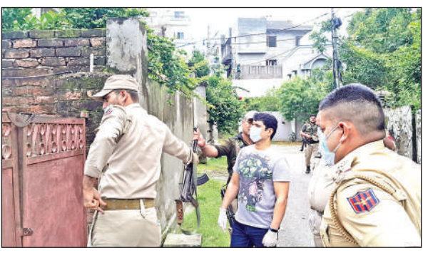
Police and locals at a house where family members were found dead.

■ STATE TIMES NEWS JAMMU: Six people, including five members of a family, were found dead under mysterious circumstances in Jammu on Wednesday, prompting police to set up a special investigation team to probe the turn of events. The bodies of the victims, including three women, were recovered from two adjoining houses in the posh Tawi Vihar in Sidhra area around 1:00 am, police said, adding that prima facie, it appears that they were poisoned. Noor-ul-Habib, Sakina Begum, her daughter Naseema Akhter and grand-