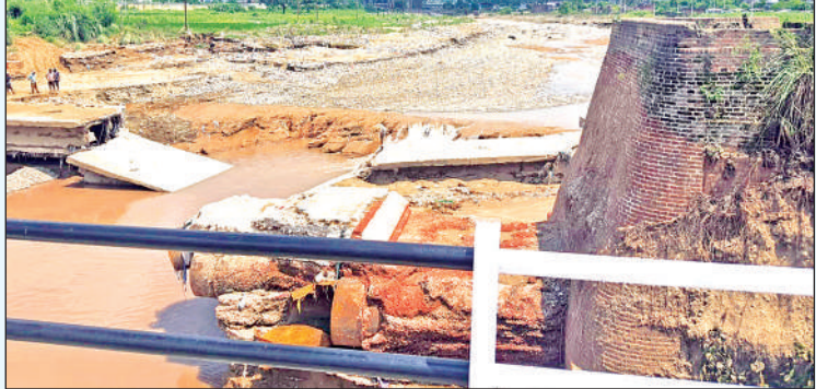
Duct of canal completely washed away depriving villagers of irrigation facility.