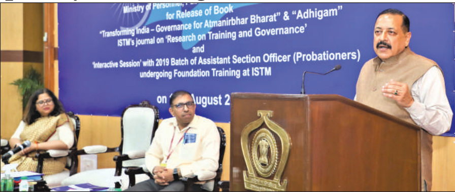
Union Minister Dr Jitendra Singh addressing Assistant Section Officer Probationers of 2019 Batch at the Institute of Secretariat Training & Management (ISTM), New Delhi on Wednesday.

Addressing the Assistant Section Officers (Probationers) of 2019 Batch at the Institute of Secretariat Training & Management (ISTM) here, Dr Jitendra said, the entire nation looks towards you for playing your role