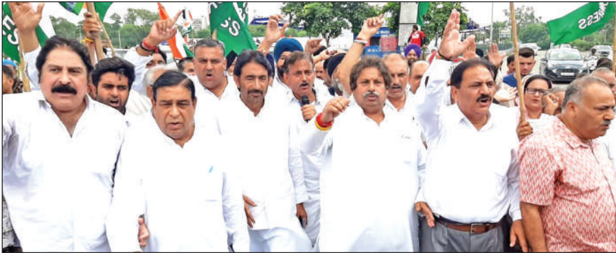
Congress leaders taking out protest rally in Jammu on Wednesday.