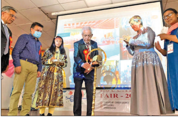
A dignitary lighting ceremonial lamp at Leh.

tude of the Ladakhi youth for coming back to Ladakh after the completion of their higher education to work for the benefit of society.