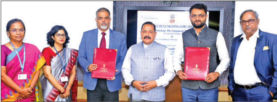
Union Minister Dr Jitendra Singh during signing of an Agreement between Technology Development Board under Ministry of Science & Technology and M/s Multi Nano Sense Technologies Private Limited, at New Delhi.

Dr Singh presided over the signing of an MoU between