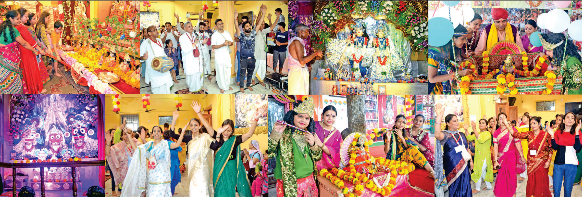
Glimpses of Shri Krishna Janmashtami celebrations in Jammu on Friday.