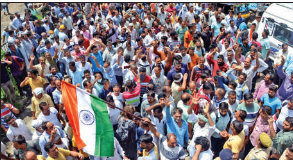
Daily-wagers of Jal Shakti Department taking out protest rally at Jammu on Monday.