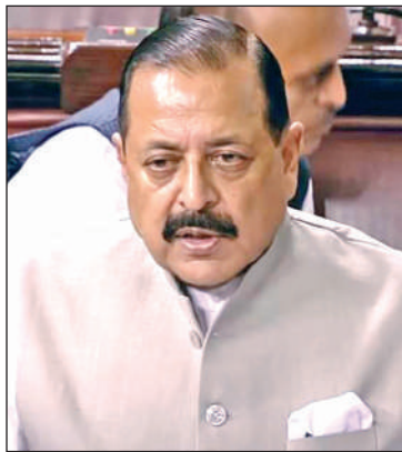
Union Minister Dr Jitendra Singh replying to the debate on "Indian Antarctica Bill 2022" in Rajya Sabha on Monday.

Speaking about the Bill, Dr Jitendra Singh said, the bill is in pursuant to India's accession to Antarctic Treaty, the Protocol on Environment Protection (Madrid Protocol) to the Antarctic Treaty