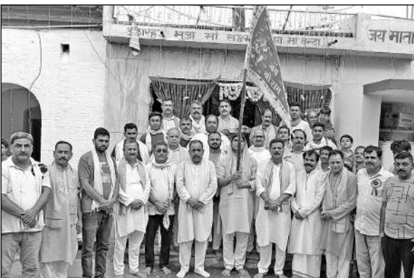
Club members and dignitaries during the flag hoisting ceremony.