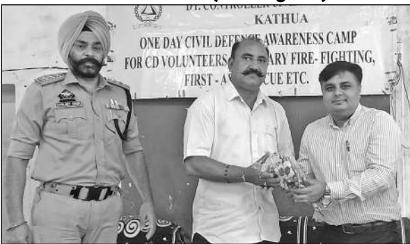
Dignitaries being honoured during the programme.

The dignitaries presented their valuable suggestions