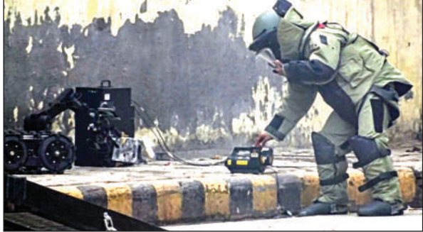
Bomb disposal squad checking IED at Tral.

SRINAGAR: Police on Sunday claimed to have averted a "major" terror incident by destroying an improvised explosive device (IED) recovered in the Pulwama district. The IED, weighing about 10-12 kg, was recovered