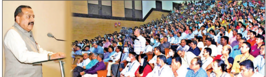
Union Minister Dr Jitendra Singh addressing a jam-packed audience of students and faculty at the prestigious "CSIR-National Chemical Laboratory", Pune on Sunday.

STATE TIMES NEWS PUNE: Union Minister, Dr Jitendra Singh on Sunday launched India's first indigenously developed Hydrogen fuel cell Bus developed by KPIT-CSIR in Pune. Later, addressing a jam-packed audience of students, scholars and faculty, at the prestigious CSIR-National Chemical Laboratory here, Dr Jitendra said, Prime Minister Narendra Modi's Hydrogen vision is important for India to ensure Atma Nirbharta which implies affordable and accessible clean energy, meeting climate change goals and creating new entrepreneurs and jobs. He said, Green hydrogen is an excellent clean energy vector that enables deep decarbonization of difficult-to-abate emissions from the refining industry, fertiliser industry,