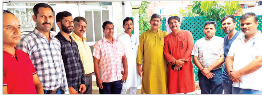
Deputations from various locations calling on Member Parliament Jugal Kishore Sharma.

stock will damage the socio-economic circle of villagers and their live will come to hand to mouth. Moreover, this may also cause a new disease to the infants who are getting feed from the infected cows.