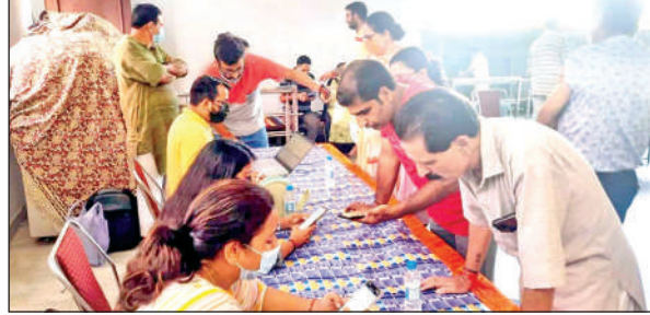
People visiting booster dose vaccination camp at Bhagawaan Gopinathji Ashram, Jammu.