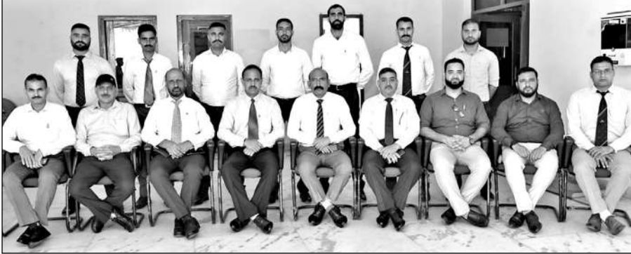
SKPA officials along with participant officers during the training.