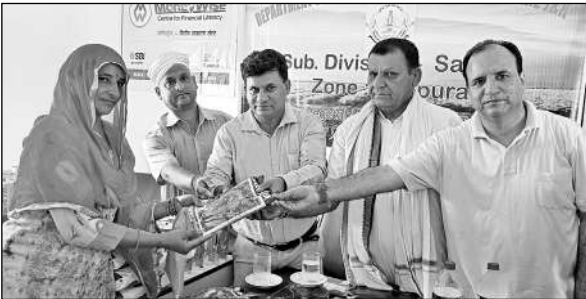
Officials handing over seeds to a farmer.