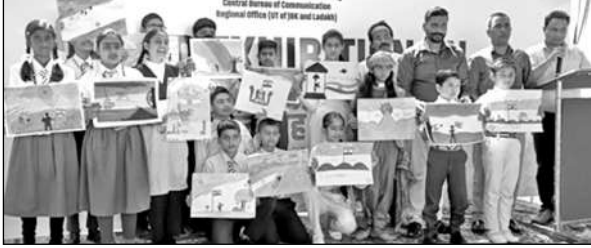
Organisers along with students during the event.

The programme was aimed to aware the students about the sacrifices being made by the freedom fighters during the