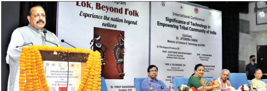
Union Minister Dr Jitendra Singh, as Chief Guest, addressing the inaugural session of 2-day International Conference on "Significance of Technology in Empowering Tribal Community of India" at Jawaharlal Nehru University (JNU) New Delhi on Tuesday.