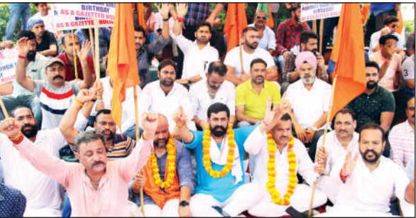
Yuva Rajput Sabha members raising slogans during hunger strike at Jammu on Tuesday.