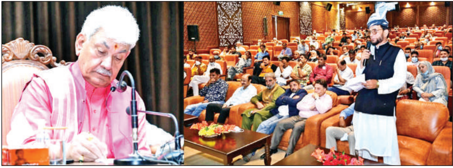
Lieutenant Governor Manoj Sinha interacting with PRI representatives and members of Civil Society from Ganderbal.

Acknowledging the efforts of PRIs, Civil Society Groups during Shri Amarnath ji pilgrimage, the Lt Governor said that the