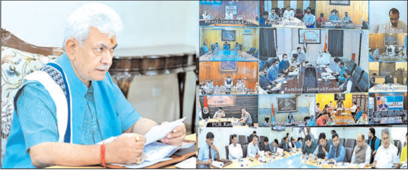
LG Manoj Sinha interacting with randomly selected applicants from across UT during LG's Mulaqaat programme.