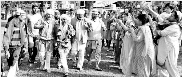
Devotees taking out Kailash Yatra at Bhadarwah.

This year much to the relief of devotees, authorities lifted all the restriction thereby paving the way for thousands of Nag followers to rejoice in