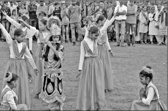
Students performing a skit during the Mela.

The day also witnessed varied sports activities organized by the Department of Youth Services and Sports Udhampur, besides cultural programmes presented by