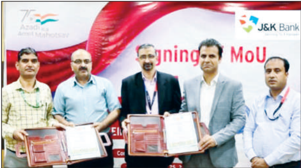
J&K Bank and Ellaquai Dehati Bank representatives after signing MoU.

As per the agreement, cash deposit facility has been extended to EDB at 110 designated branches and 3 other touch points of J&K Bank across the UT and EDB in turn has designated J&K Bank as 'the Preferred Banker' for its dealings with respect to all banking related services.