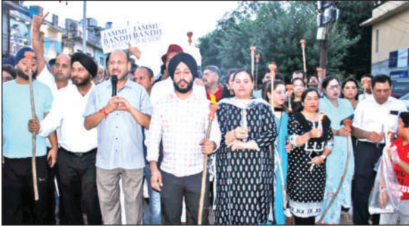
Lawyers taking out Mashaal rally at Jammu.

All the Bar Associations of Jammu province have already expressed their support to the demands projected by J&K High Court Bar Association, Jammu which include besides construction of multi storey building for housing registration authority, CAT, DRT, AFT, Consumer Courts, Tribunals, Commissions etc. at Janipur, Court complex, Jammu, similar facilities for registration, consumer and other quasi-judicial institutions in the Court complexes at district