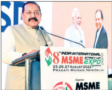
Union Minister Dr Jitendra Singh addressing "India International MSME & Start-up Summit and Expo" at Pragati Maidan, New Delhi.

Addressing the "8th India International MSME & StartUp Summit and Expo", as chief guest, Dr Jitendra said, this sector has played an important role in shaping the Atma Nirbhar Bharat and added that the government has substantially increased the budget in the last eight years to strengthen the MSME sector. The Minister also informed that the government is encouraging unique local products to reach the global markets and, in the process, strengthening the Indian economy. Dr Jitendra reminded the audience about the commit-