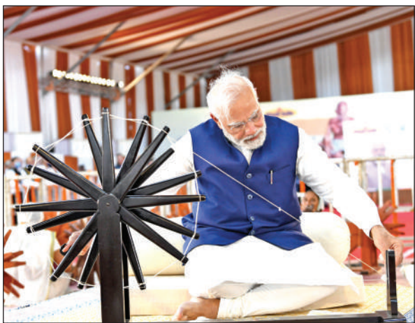
Prime Minister Narendra Modi spinning 'Charkha' in Khadi Utsav at Sabarmati River Front, Ahmedabad.