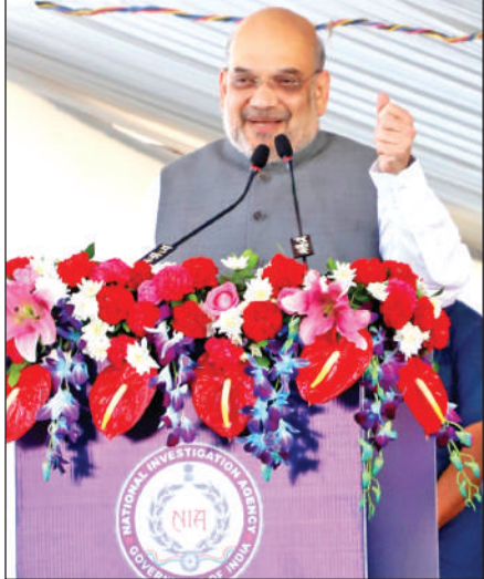
Home Minister Amit Shah addressing after inauguration of NIA office in Raipur Chhattisgarh on Saturday.

■ STATE TIMES NEWS RAIPUR: Union Home Minister Amit Shah on Saturday said the Narendra Modi government took all efforts to strengthen probe agencies such as the NIA and anti-terror laws in line with its policy of zero tolerance towards terrorism. The National Investigation Agency will have branches in all the states by May 2024, he said. The home minister was speaking at the inauguration of the office building of the NIA's Raipur branch in Atal Nagar area of Nava Raipur. The Modi government has adopted zero tolerance policy against Left Wing Extremism, terrorism and other related crimes including fake currency and narcotics, and therefore we left no stone unturned to strengthen the NIA, he said. The BJP-led Union government also strengthened anti-terror laws, shared terrorism-related inputs with state governments irrespective of the party ruling in a state, strengthened anti-terror investigation agencies and increased conviction rate in such crimes, Shah added. In line with this (policy), our government worked towards strengthening the NIA. I am happy that in the cases handled by NIA, the conviction rate has reached 94 per cent from 75 per cent in 2014," he said.