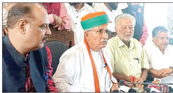
Union Minister Arjun Ram Meghwal briefing media at Anantnag on Sunday.