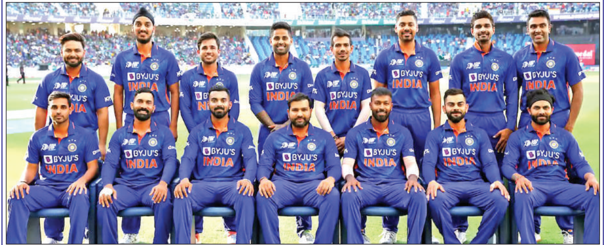
Asia Cup 2022: Jubilant Team India as Hardik Pandya finishes in style to defeat Pakistan by 5 wickets. (Details on Page 10)