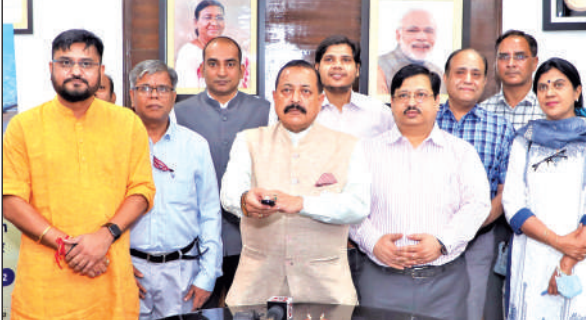
Union Minister Dr Jitendra Singh launching a dedicated Website www.swachhsagar.org to give further boost to ongoing Coastal Cleanup Campaign, at New Delhi on Sunday.

■ STATE TIMES NEWS NEW DELHI: Senior public figures, film celebrities, students and people from all walks of life have joined the ongoing pan-India Beach/Coastal Cleaning campaign, resulting in an overwhelming response to this 75 days exercise which is to conclude on September 17. This was stated by Union Minister of State (Independent Charge) Science & Technology; Minister of State (Independent Charge) Earth Sciences; MoS PMO, Personnel, Public Grievances, Pensions, Atomic Energy and Space, Dr Jitendra Singh who, encouraged by this huge response on such a large scale, today launched a dedicated Website www.swachhsagar.org to give further boost to the Cleaning Mission. The Minister also launched the Campaign Logo-Vasuki, dedicated to the youth of the country, as they are along with the school students taking keen interest and joining the coastal and beach cleaning activities. Briefing the media about the progress so far of this longest ever campaign of