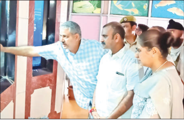
Union MoS for Information and Broadcasting and Fisheries, Dr. L. Murugan during visit to fisheries farm.