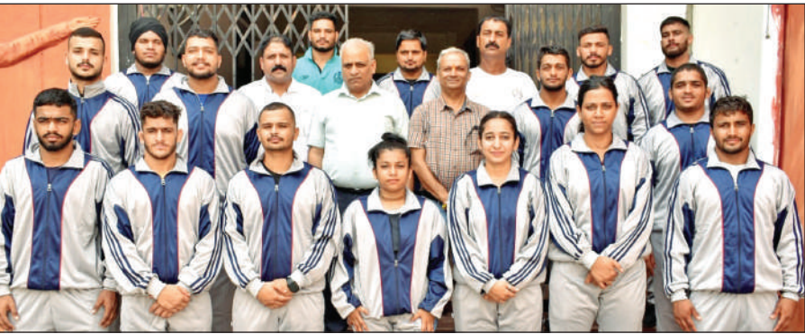
Wrestlers posing for a photograph with dignitaries.