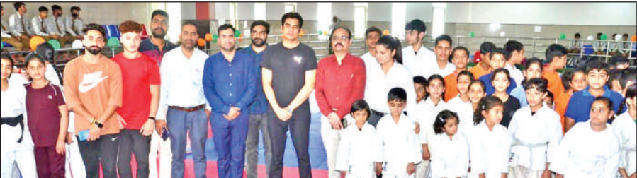
Karate players posing for a photograph with dignitaries.

The objective of the coaching camp was to introduce new rules, techniques, belt grading