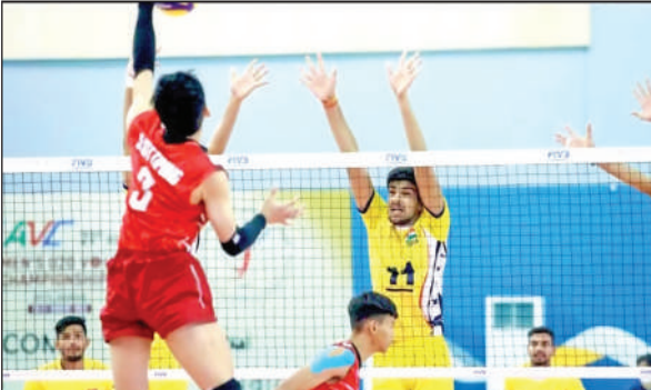
A match going on between India and Thailand at 21st Asian Men's U20 Volleyball Championship.