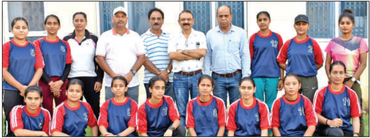
Girls kabaddi team posing for a photograph with dignitaries.