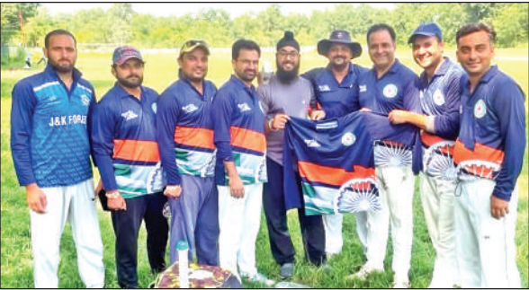
Media Cricket Club team posing for a photograph.