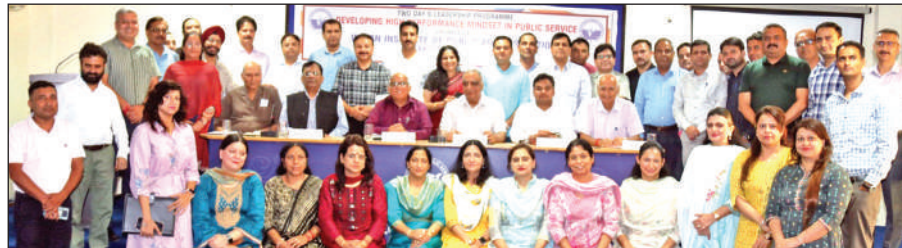
IIPA J&K Regional Branch members and others at Leadership Programme.