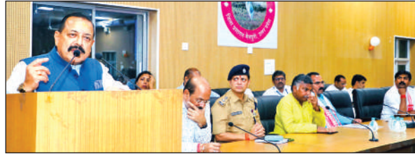
Union Minister Dr Jitendra Singh addressing an interactive meet of experts from Central Leather Institute Kanpur and College students, on Monday.

The Minister also offered seed funding to prospective Start-ups and innovative