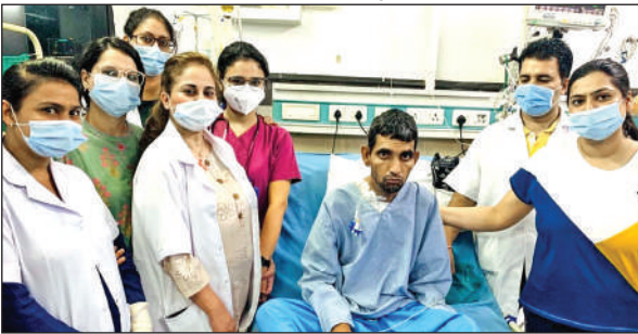
Doctors with patient after performing surgery at SSH Jammu.

JAMMU: Bringing a big relief to patients of Jammu province, Cardiac surgery is now being carried out routinely at Government Super-Specialty Hospital (SSH) Jammu under Ayushman Bharat Sehat scheme for which patients don't have to shell out anything from their pockets, as it is the benefit of the scheme launched by Prime Minister Narendra Modi, which covers almost every citizen of Jammu & Kashmir. As per details, 40 years old man who had suffered poliomylitis in his childhood and has weakness of left upper and lower limbs and had rheumatic heart disease with very heavily calcified heat valve with severely narrowed mitral valve causing severe breathlessness and irregular heart beat for years together. Besides he had also suffered stroke and had infarct in brain for which he was under medication. He had to get repeated hospital admissions for his ailments. He was prepared up for heart surgery in the Department of CTVS and Department of Cardiothoracic Anesthesia & Intensive Care Unit at Government SSH, Jammu and finally the surgery was done on August 1, 2022. The surgical team comprised