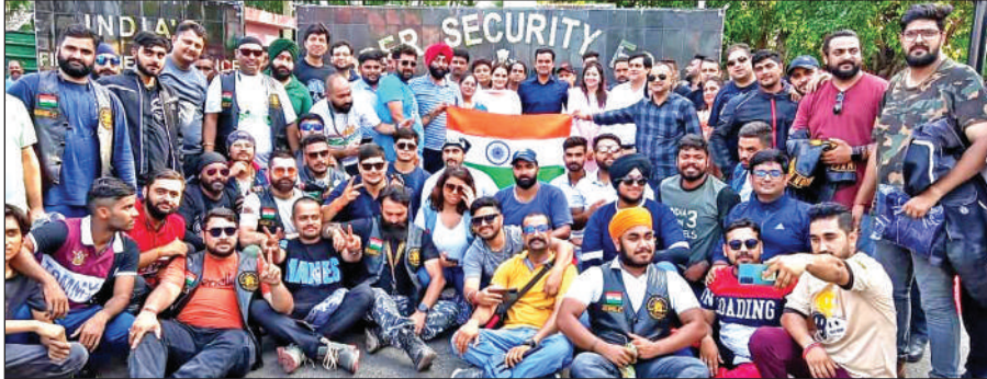
Participants of Bike Rally posing for a photograph with dignitaries.

JAMMU: Directorate of Tourism, Jammu, in collaboration with Divisional Administration Jammu and Surinsar Mansar Development Authority, on Saturday organized a Bike Rally from Kala Kendra, Jammu to Suchetgarh via Surinsar, Mansar, Baba SidhGoria and Baba Chamliyal as a part of 'Azadi Ka Amrut Mahotsav' and 75th Independence celebrations. The main aim of the Bike Rally was to infuse the spirit of nationalism among the youth and also to promote the offbeat tourist destinations of Jammu region thereby projecting these sites on the tourist map. The rally was one of its kind as Baba SidhGoria, Baba Chamliyal and Suchetgarh are part of Border Circuit being pitched by the department. The bike rally was flagged off