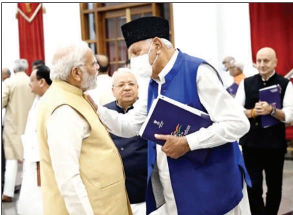
PM Narendra Modi after chairing third meeting of National Committee on 'Azadi Ka Amrit Mahotsav'. Ex-CM J&K Dr Farooq Abdullah and Anupam Kher also seen in picture.

noted that the success of Azadi ka Amrit Mahotsav is due to the contribution of every citizen of the country, and the committees at national, state and district levels have been working day and night to take it to the masses.