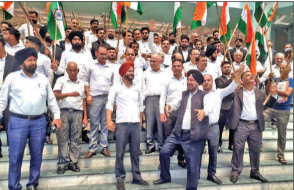
Lawyers raising slogans during a protest at Jammu.