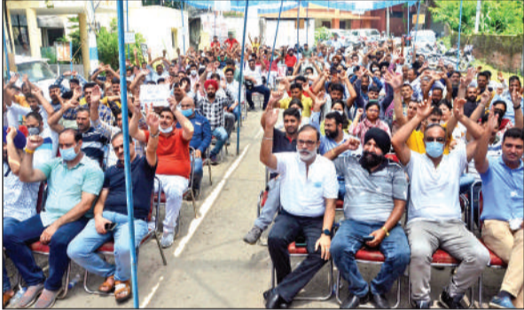
PDD employees during a protest at Jammu.

JAMMU: A number of employees and engineers of Power Development Department (PDD), under the banner of Jammu & Kashmir Power Employees and Engineers Coordination Committee (JKPEECC) held protests in all district headquarters of Jammu, Kashmir and Ladakh UTs, supporting call of National Coordination Committee of Electricity Employees and Engineers (NCCOEEE) for nationwide protest against introduction of the Electricity (Amendment) Bill 2022, which will open up distribution of power for private play-