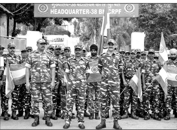
CRPF personnel during Tiranga Rally at Samba.