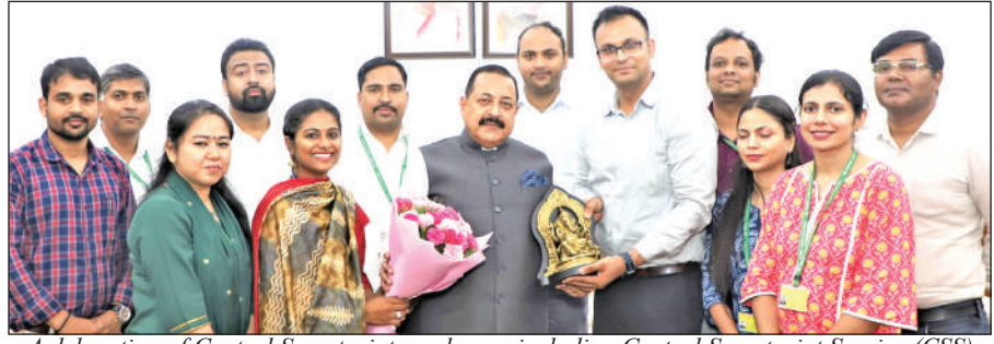
A delegation of Central Secretariat employees including Central Secretariat Service (CSS) Forum and direct recruits of Limited Departmental Competitive Examination (LDCE) calling on Union Minister Dr Jitendra Singh at DoPT headquarters, North Block, New Delhi.

The Department of Personnel & Training (DoPT) had, on the instructions of Minister Incharge DoPT Dr Jitendra Singh, recently