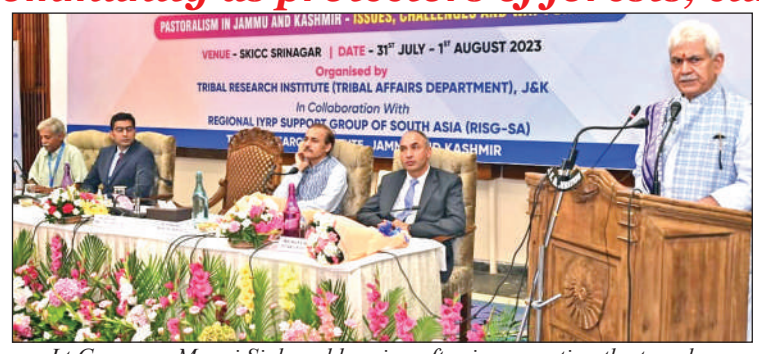
Lt Governor Manoj Sinha addressing the two-day workshop on Pastoralism in Jammu Kashmir on Monday.

"Pastoralism is one of the oldest professions in the world. Nomadic livestock plays an important role in the business and livelihood of the communities and it is deeply connected with heritage, culture, traditional knowledge and co-existence with nature," the Lt Governor said. The workshop will help in developing a holistic strategy and action plan for improved livelihoods and regeneration of pasture land and rangelands, he added. At the inaugural session, the Lt Governor highlighted the concerted efforts of the UT Administration, under the guidance of Prime Minister,