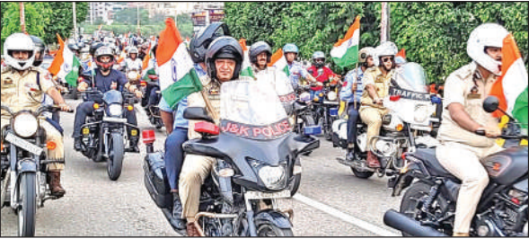
DIG Traffic leading motorcycle Tiranga rally.

A total of 100 Harley Davidson bike owners took part