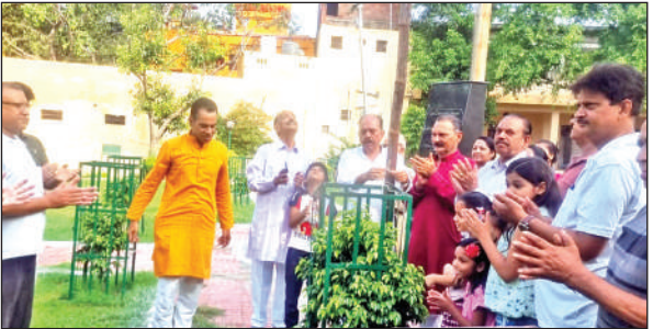
Morning Walkers Association members Rehari Colony Jammu during I-Day celebration.