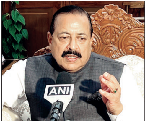
Union Minister Dr Jitendra Singh speaking to media after Chandrayaan-3 mission accomplished "Vikram" lander's successful detachment from the propulsion module, at New Delhi on Thursday.

■ STATE TIMES NEWS NEW DELHI: Union Minister, Dr Jitendra Singh on Thursday said, the exclusive findings and inputs from Chandrayaan-3 will benefit the entire world community. Speaking to the media after the Chandrayaan-3 mission achieved another historic feat when the "Vikram" lander module of the spacecraft, carrying the Pragyan rover, successfully detached itself from the propulsion module in its onward lunar journey, Dr Jitendra said, even though the USA and the then USSR had started their Space journey long before us and America also landed a human being on the surface of Moon in 1969, it was nevertheless our Chandrayaan that brought home the pictures of water on the surface of Moon and started the entire world including the Americans. "We always heard imaginary fiction and asked ourselves whether there were any people living on the Moon, but for the first time Chandrayaan's findings prompted the world community to find scientific answers to these mysteries," he said. Dr Jitendra said that India will be the fourth country in the world to achieve this feat after the United States, Russia, and China, but India will be the only country in the world to land on the lunar South Pole.