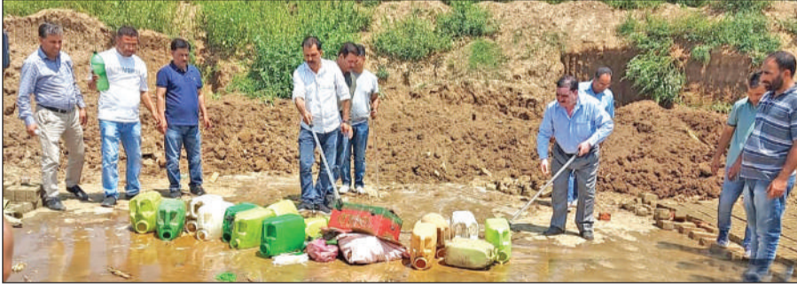
Excise sleuth destroying seized Lahan at Budgam.