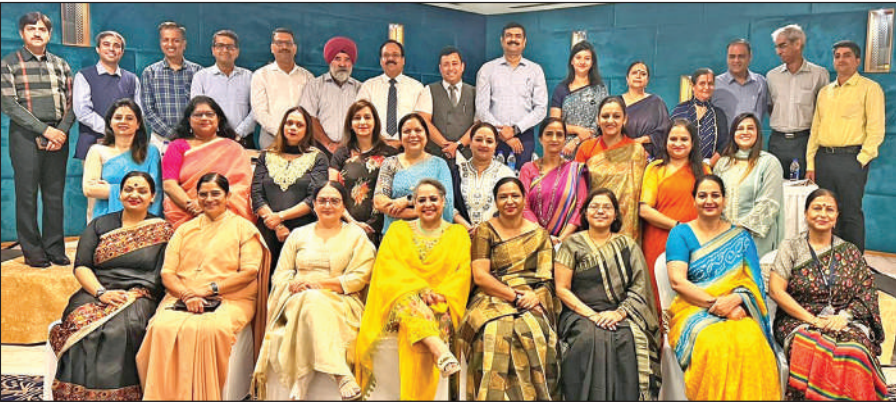
Jammu Sahodaya School Complex members during General Body Meeting at Jammu.