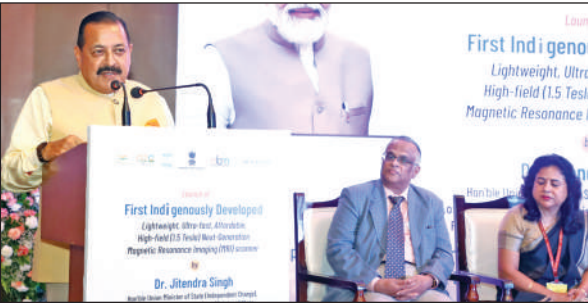
Union Minister Dr Jitendra Singh launching India's first indigenously developed MRI Scanner at New Delhi.

Dr Jitendra said, as an indigenous MRI scanner is made available, the cost of MRI scanning is expected to reduce considerably for the common man thus allowing a wider access to the otherwise highly priced MRI scans.