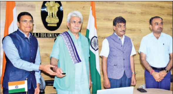
LG Manoj Sinha laying e-foundation stone for restoration of Holy Shrine of Shiv Khori by JSW Foundation.

He added: "Due to inclement weather condition, I couldn't join the ceremony in person. I extend my best