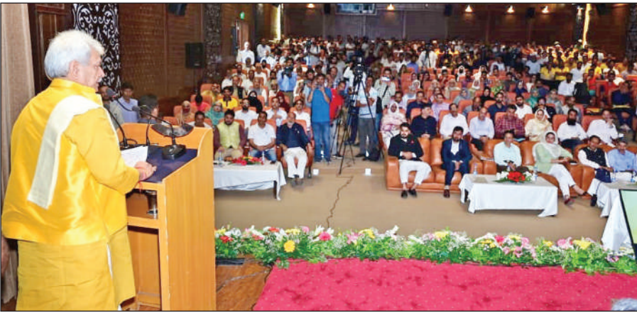
LG Manoj Sinha speaking after inaugurating, laying foundation stones for various developmental projects of Budgam District on Thursday.