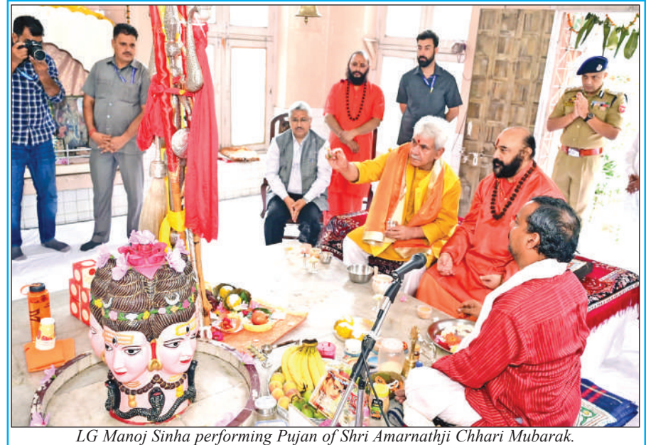
LG Manoj Sinha performing Pujan of Shri Amarnathji Chhari Mubarak.

The property was attached under the Unlawful Activities (Prevention) Act for 'wilful' harbouring of terrorists, police said.