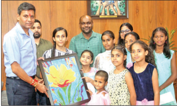
ADGP Jammu Zone Mukesh Singh presenting gift to children of SOS Village.