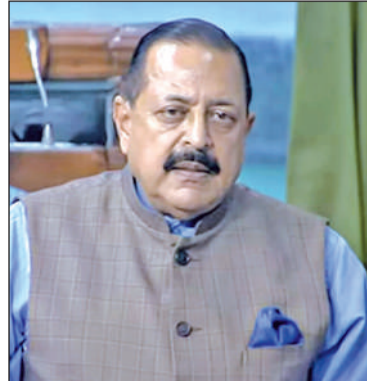
Union Minister Dr Jitendra Singh speaking in the Lok Sabha on Friday.

Introducing the Bill, Dr Jitendra Singh said, when passed by Parliament the Act will provide high level strategic direction for research, innovation and entrepreneurship in the fields of natural sciences including mathematical sciences, engineering and technology, environmental and earth sci-