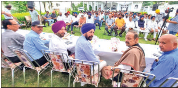
J&K BJP Manifesto Committee members interacting with people.

The reach out programme reflects the BJP's deep commitment to engage with citizens and have their views of