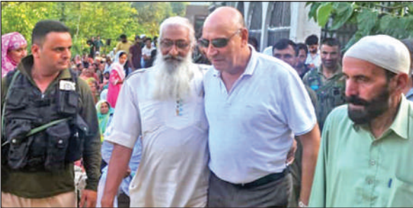
Former Minister Usman Majid visiting shrine of Hazrat Nanga Baji (RA) in Malangam, Bandipora.