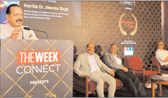
Union Minister Dr Jitendra Singh speaking after presenting "The Week" magazine awards in an event organised by the "Malayalam Manorama" publishing house at India Habitat Centre, New Delhi on Friday.