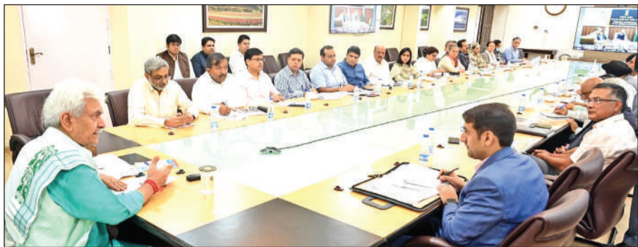
Lt Governor, Manoj Sinha interacting with citizens during 'LG's Mulaqaat' at Srinagar.

STATE TIMES NEWS SRINAGAR: Lieutenant Governor Manoj Sinha on Wednesday interacted with citizens and attended to their issues, during "LG's Mulaqaat"- Live Public Grievance Hearing programme, at the Civil Secretariat.