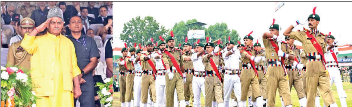
LG Manoj Sinha taking salute from the march past at Bakshi Stadium, Srinagar on Thursday.

■ STATE TIMES NEWS SRINAGAR: Lieutenant Governor, Manoj Sinha hoisted the National Flag and addressed the people at Bakshi Stadium, Srinagar, on Thursday. The Lt Governor posted on 'X', "Hoisted the National Flag at Bakshi Stadium, on the occasion of 78th Independence Day. As we celebrate the freedom and the spirit of unity, let us honor and remember the countless sacrifices made by our valiant freedom fighters and martyrs. Roots of democracy have deepened in the past five years. Today I appeal to the citizens of J&K for collective resolve to ensure that the ideals of democracy should become an important part of