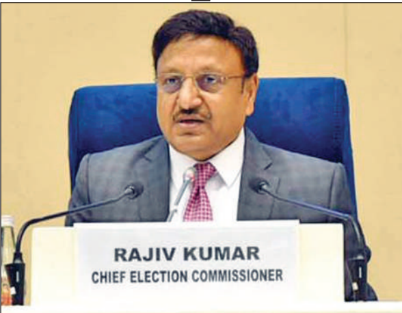
Chief Election Commissioner Rajiv Kumar addressing press conference at New Delhi on Friday.

■ STATE TIMES NEWS NEW DELHI: Assembly elections will be held in Jammu and Kashmir after nearly a decade in three phases from September 18, setting the stage for the people of the union territory to elect a government after the scrapping of Article 370 in 2019.