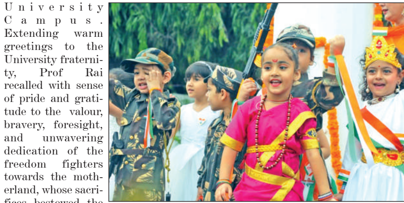
Tiny toddlers during I-Day celebrations at JU.