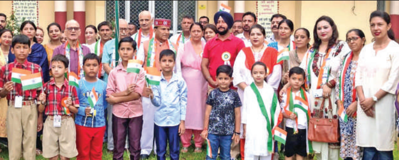
Management, faculty members of Vishwa Bharati College School during the event.