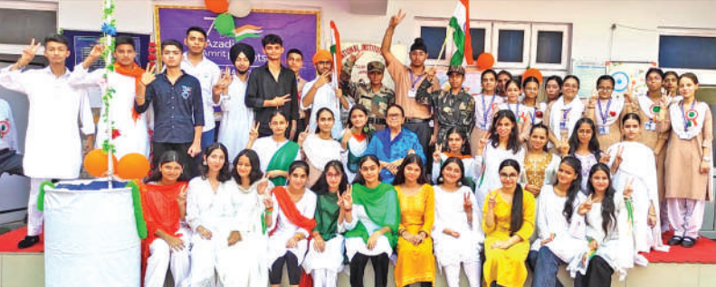
Independence Day celebrations at Kotwal National Institute of Teaching Bharat Nagar.