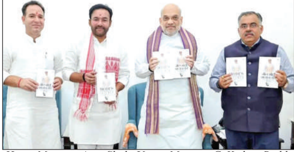
Home Minister Amit Shah, Union Minister G. Kishan Reddy releasing book of Tarun Chugh at New Delhi on Saturday.

The event, held in New Delhi, had the distinguished