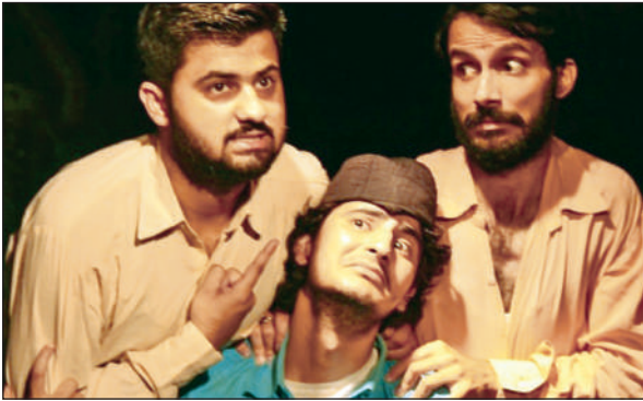
Natrag artists performing in a play.

■ STATE TIMES NEWS JAMMU: Natrang presented a hardest political satire 'Topian' written by Mani Madhukar under the direction of Neeraj Kant in its weekly theatre series 'Sunday Theatre' at its studio. Most appropriate and timely presentation on the contemporary political scene of the country, the play is a dig on the lusty politicians who can change colors faster than a chameleon just to ensure that they remain in power. For them, mission is to be befool the public and for that they have the requisite theatrical art, know-how, expertise and the excellence to transform themselves to any color or attire as per the situation and the requirement. Human civilization has witnessed lot of social and political revolutions, each time thinkers and philosophers have sold new political thoughts and doctrine