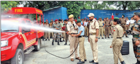
J&K F&ES team holding demo at NCC Training Academy in Nagrota, Jammu.

■ STATE TIMES NEWS NAGROTA: J&K Fire & Emergency Services (F&ES) in collaboration with 2 J&K Battalion NCC Jammu conducted a lecture cum demo at the NCC Training Academy in Nagrota, Jammu for raising awareness about fire safety and emergency response procedures for 500 Cadets.