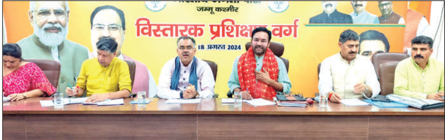
Union Minister G Kishan Reddy flanked by BJP National General Secretary Tarun Chugh briefing media at party Headquarters in Jammu on Thursday.