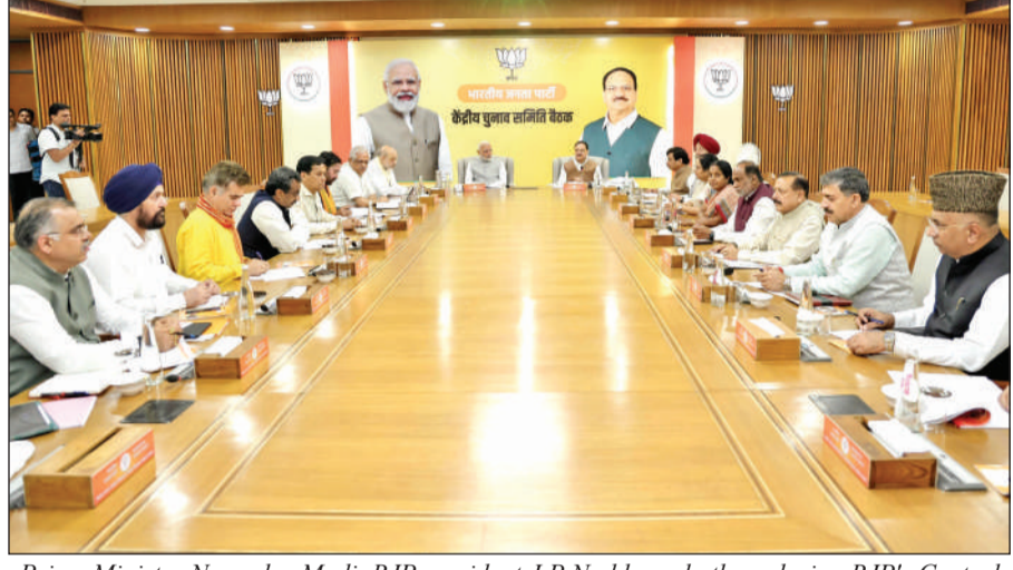
Prime Minister Narendra Modi, BJP president J P Nadda and others during BJP's Central Election Committee meeting at New Delhi on Sunday.

STATE TIMES NEWS NEW DELHI: The BJP's Central Election Committee (CEC) met on Sunday evening to finalise the party's candidates for the upcoming assembly polls. Prime Minister Narendra Modi and BJP president J P Nadda were joined by other CEC members, including Home Minister Amit Shah, as they deliberated with party leaders from Jammu and Kashmir. Last week, the J&K leaders had held a long meeting with Nadda and Shah, among others, to narrow down the list of probable candidates and strategise for the polls. The CEC will later be holding meeting with Haryana leaders to finalise party candidates for the assembly polls. The 90-member assembly of the Union Territory