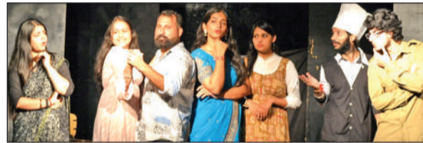
Natrang artists performing in Hindi play 'Coffee House Wali Ladki'.