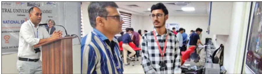
A dignitary speaking in a programme at CUJ.