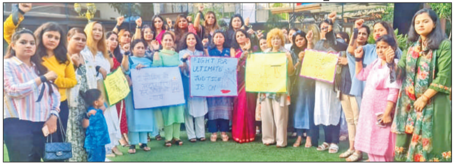
Women Cell of Vishv Mangley Sabha raising slogans during a rally.

STATE TIMES NEWS JAMMU: The Women Cell of the Social Organisation, Vishv Mangley Sabha, organized a meeting and rally to condemn the heinous crime of rape and murder of a lady doctor in Kolkata.