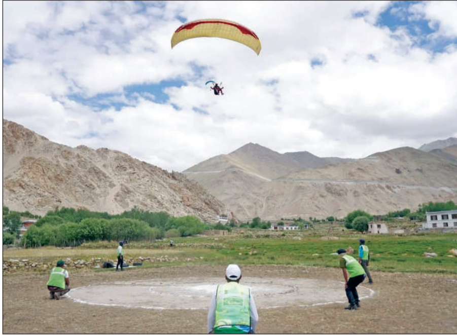
Participant at paragliding accuracy competition in Leh.

The festival was officially flagged off by CEC Tashi Gyalson. The five-day event, which commenced with registration yesterday, promises to be a groundbreaking celebration of aero sports and adventure. The competition features 45 pilots across