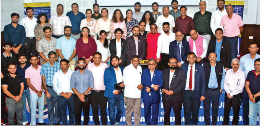
Dignitaries along with participants after the workshop.