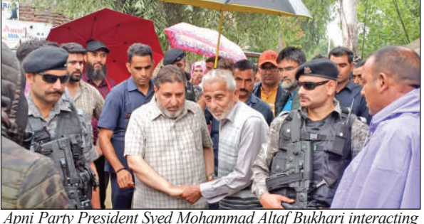
Apni Party President Syed Mohammad Altaf Bukhari interacting with people at Rawalpura.

upcoming assembly elections. Bukhari gave a patient hearing to the public complaints and assured them that he would bring these issues to the notice of the concerned officials, ensuring the redressal of these problems," the press release said.