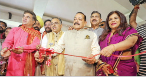
BJP senior leaders inaugurating media war room in Jammu.

mary purpose of setting up the Media War Room is to ensure that the party's voice reaches the public efficiently and effectively through various media channels.