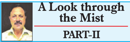
A Look through the Mist PART-II

(iii) Self Rule Framework suggests at Para 7 < Economic Integration > . (iv) Self Rule framework at Para 8