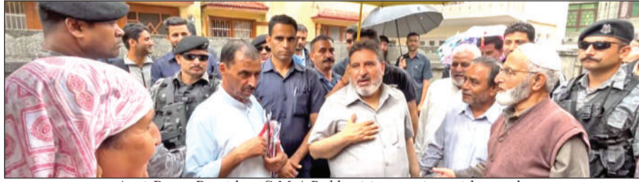
Apni Party President S.M.A Bukhari interacting with people.

STATE TIMES NEWS SRINAGAR: Apni Party President Syed Mohammad Altaf Bukhari, on Thursday, urged people to use their votes wisely in the upcoming assembly elections. He was speaking to reporters while he was continuing his poll campaign in Chanapora constituency. Bukhari pointed out that "the assembly polls are being held after a decade in Jammu and Kashmir, and during this period the people have suffered hugely, facing deaths and destruction here."