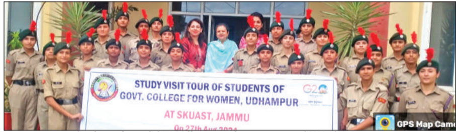
Students from GCW Udhampur during visit to SKUAST-Jammu.