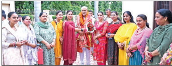
Women delegation congratulating Sham Lal Sharma, former Minister for nomination of candidate from Jammu North.