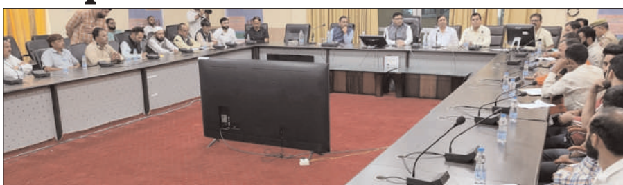
Observers interacting with political leaders.