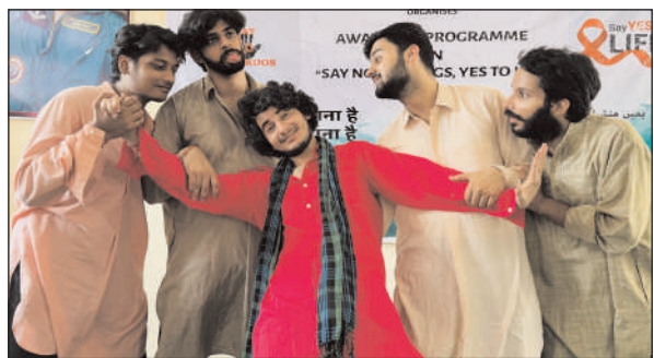
A scene from the play Jaal.