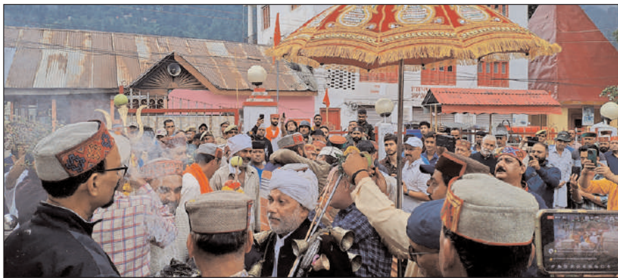
Devotees taking out Kailash Yatra at Bhadarwah.