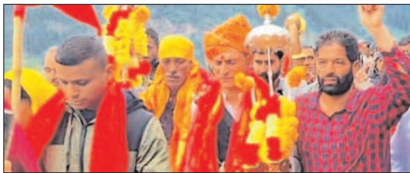
Devotees taking out Yatra from Dudu.

STATE TIMES NEWS UDHAMPUR: The three-day historical Annual Kailash Kund Yatra, commenced today with traditional fervor and enthusiasm starting from the Vasuki Nag Temple PDA Complex Dudu in Udhampur District. The