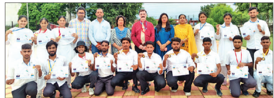
GDC Marh faculty and students posing for a photograph.