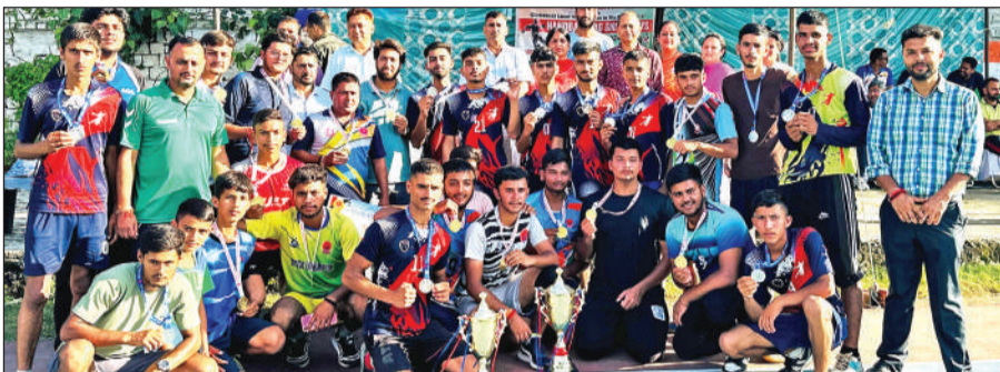
Winner teams posing for a photograph with officials.