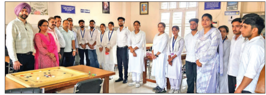
Students and faculty during a sports event.