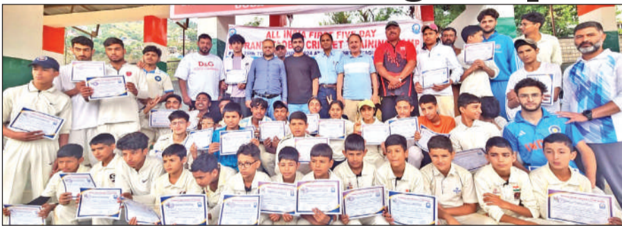
Participants posing for a photograph with dignitaries.