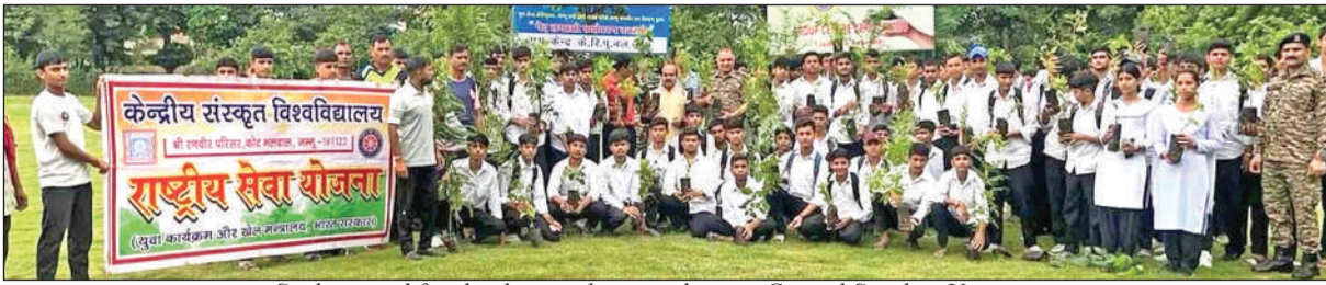
Students and faculty during plantation drive in Central Sanskrit University.

STATE TIMES NEWS JAMMU: A plantation program was organized on Friday under the joint aegis of NSS Unit of Central Sanskrit University, Shri Ranbir Campus, Kot-Bhalwal, Jammu and