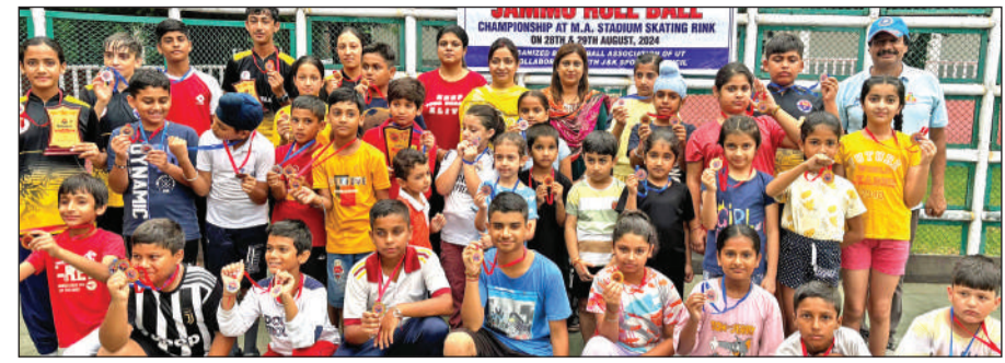
Rollball players posing for a photograph with officials.

STATE TIMES NEWS JAMMU: The District Jammu RollBall Championship concluded at the MA Stadium Skating Rink, here with around 100 skaters participating in the event. Despite rain interruptions, which limited the event to Junior category matches, the championship showcased some intense competition. In the Under-11 category, Team