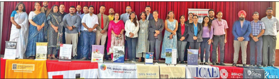
Jodhamal School faculty and ICAE India members at Mega Indo-Global University Fair.