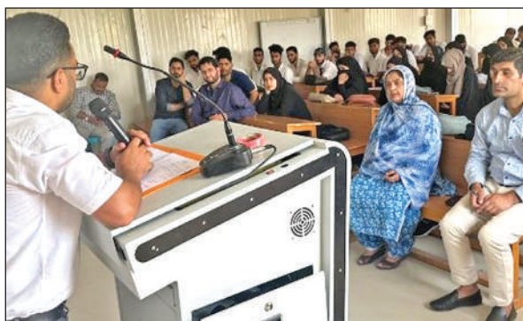
ACB official speaking at a programme.

Speakers from the ACB delivered presentations on corruption's impact on society, the workings of the ACB, and the process for