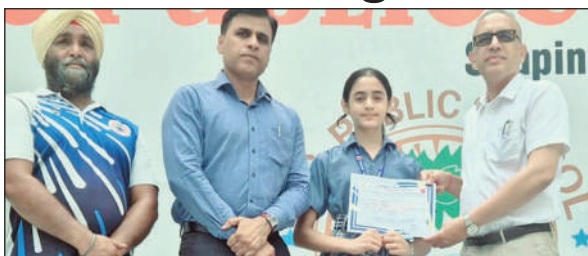
KCPS faculty felicitating a winner student.