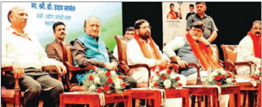
Dr CM Maharashtra, Eknath Sambhaji Shinde with other dignitaries at AIIMS Jammu.

JAMMU: All India Institute of Medical Sciences (AIIMS) Jammu stood at the heart of a historic and patriotic initiative with the hosting of the 'Sindoor Maha Raktdaan Yatra' - a large-scale blood donation camp dedicated to the valour, sacrifice, and indomitable spirit of the Indian Armed Forces. The event became a confluence of healthcare excellence, national pride, and community service, drawing the presence of prominent leaders from the Union and State governments. This noble initiative, envisioned by Eknath Sambhaji Shinde, Deputy Chief Minister of Maharashtra, was organised for the first time on such a scale after Independence. In Jammu & Kashmir, the programme was conducted simultaneously at four centres -Base Hospital Srinagar, Command Hospital Udhampur, Military Hospital Jammu and AIIMS Vijaypur (Jammu).