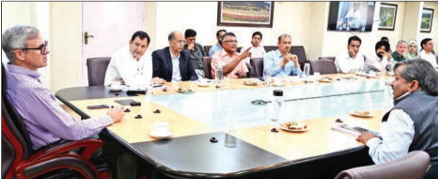
Chief Minister Omar Abdullah chairing high-level review meeting on Monday.